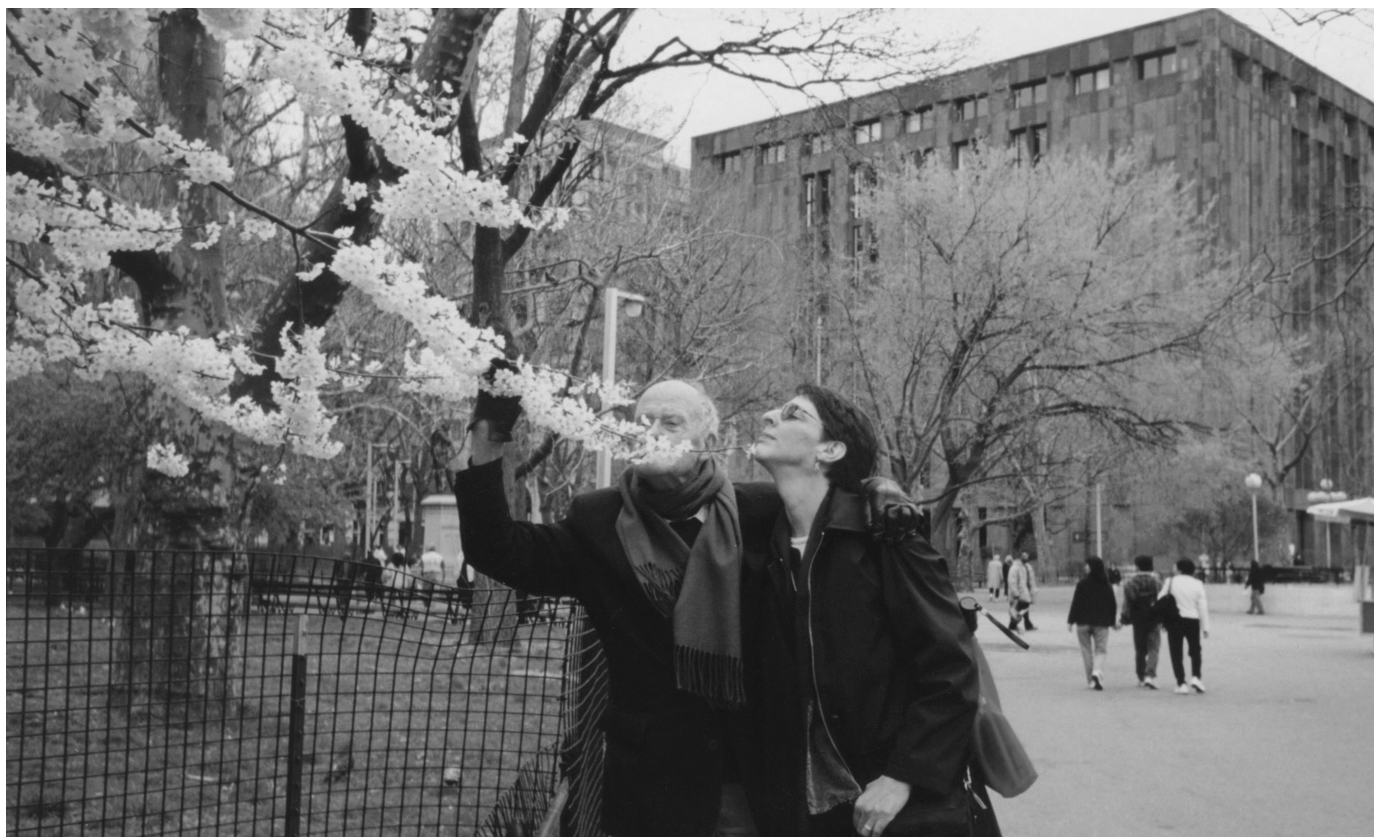
FIGURE 2. Jean Rouch in an antic moment en route to his retrospective, New York, April 2000.

works Moi, un Noir (1959) and La pyramide humaine (1961). Both films are set in Abidjan. The first film is set among migrants from Niger working in the slums of Treichville. The second is a drama created with black and white students in a fictional integrated high school class (a film credited as the precursor to his cinema verité classic, Chronique d'un Été [1961]).