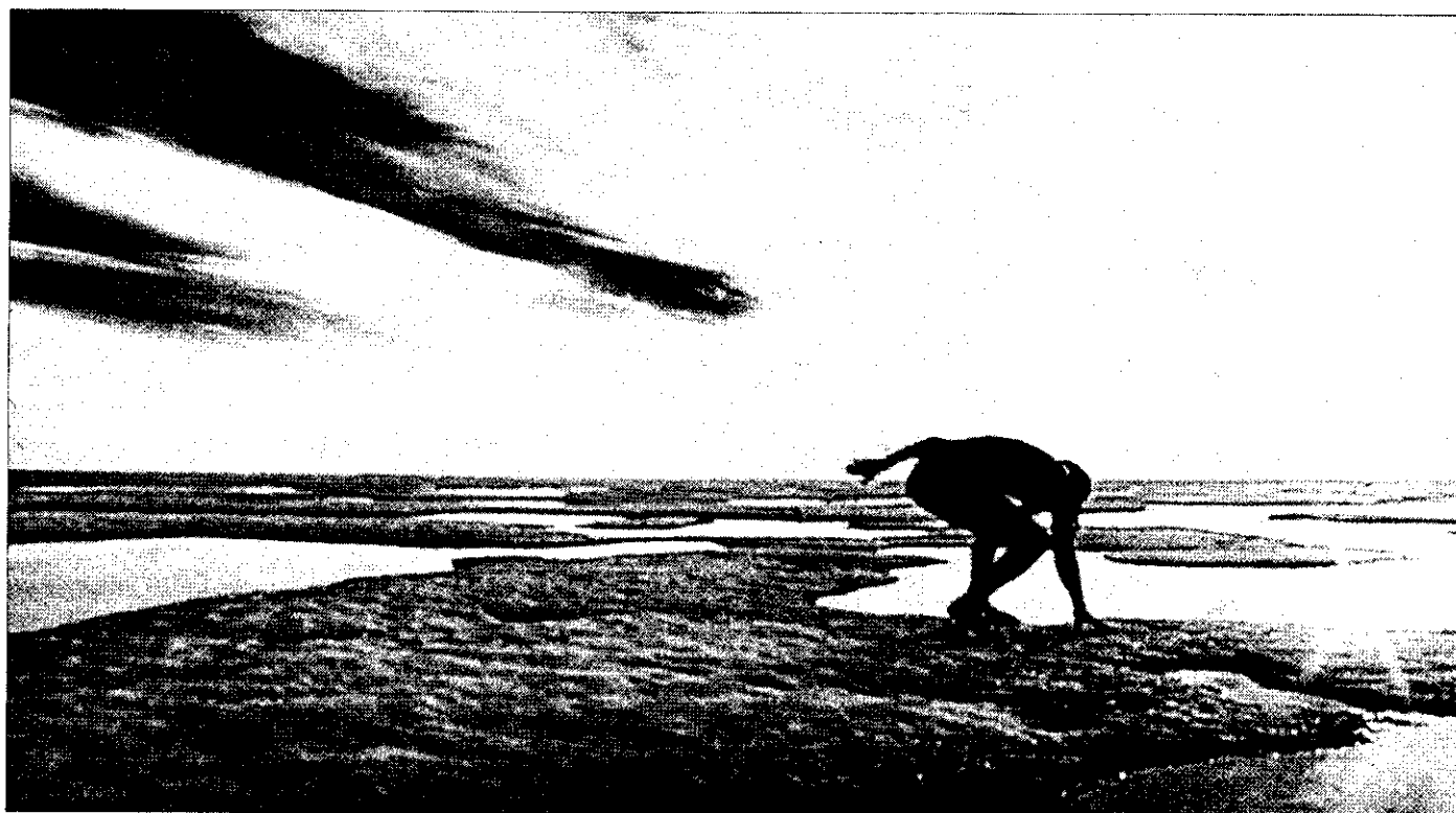
FIGURE 1. Atanarjuat, The Fast Runner . 2001. Director Zacharias Kunuk. 172 min. U.S. distribution—Lot 47 Films, New York.