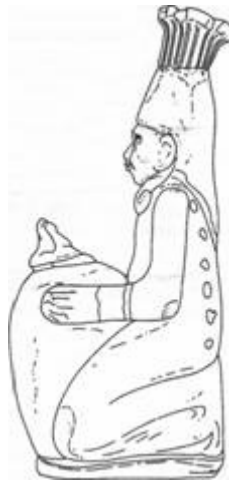
Figure 1. Faience Vessel In The Form Of A Kneeling Woman: Oriental Import From La Castellina.