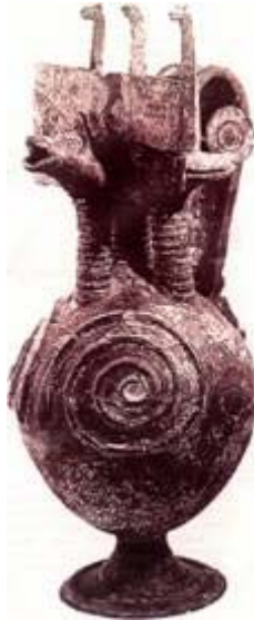
Figure 1. Impasto Oinochoe, From Sirolo, About 525-500 B.C. Height, 53.3 Centimetres. Ancona, Museo Archeologica 57888. From G. Colonna, Editor, Eroi e Regine: Piceni Popolo d' Europa (De Luca: Rome, 2001) Page 353, Number 133.

This has been published only twice, and the author was hardpressed to find any convincing parallels. In fact, he cited some vases that had three distinct spouts but were otherwise completely unlike this jug. Because it is so peculiar and because there are no convincing parallels, one might easily assume it is a forgery. If it were on the art market, it is likely that many experts would be suspicious, and some would surely condemn it as modern. But, this piece was excavated in 1989. It comes from a large tomb at Sirolo, just south of Ancona, and appeared in an exhibition of Picene art at Rome's Palazzo Barberini in 2001. It is an excellent example of the surprising idiosyncrasies of regional Italic and Etruscan art. Thus, it is dangerous to say, I've never seen anything like that before, and therefore it must be a fake. No one, no matter how dedicated, can hope to see or remember everything. And, of course, only a small part of what the ancients created has survived for us to see at all.