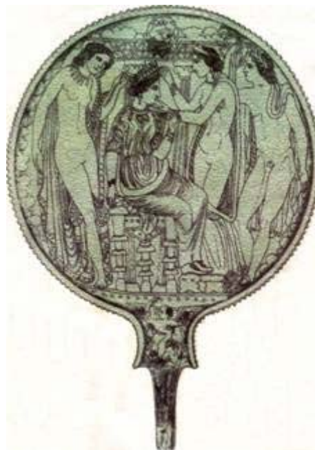
Scene Of Adorning The Bride; In The Background, The Head Of Silenus Is Propheying About The Bride's Future. Mirror In The Staatliche Museen, Berlin. Etruskische Spiegel , Volume 2, Number 212.