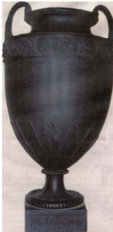
Wedgwood Urn, Late 18th Century. See Story On Page 8.

The British Museum plans to publish the site reports and the reports from various countries in a forthcoming issue of Archaeological Reports .