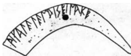
A Facsimile Of A Raetic Inscription. It Reads pithale lemais zinake: Pithale has dedicated (me) to Lemai. (From Rix, Plate 2, Number 6.)

This monograph was composed for a linguistic audience, but the conclusion that Raetic and Etruscan, together with Lemnian, belong to the same linguistic stock is one that is of importance to all Etruscologists.